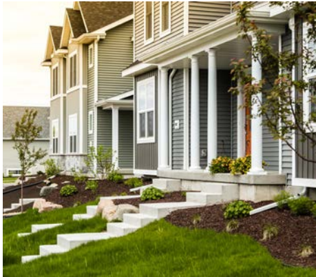
Photos are representative, not photos of Midpoint Meadows.