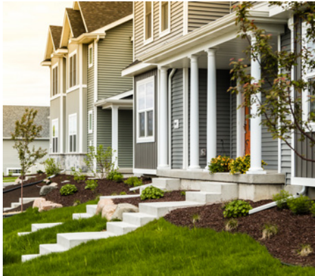
Photos are representative, not photos at Midpoint Meadows.