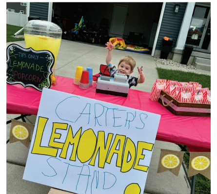
3