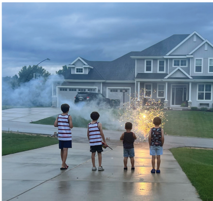
1 | Submitted by Becky Balistreri