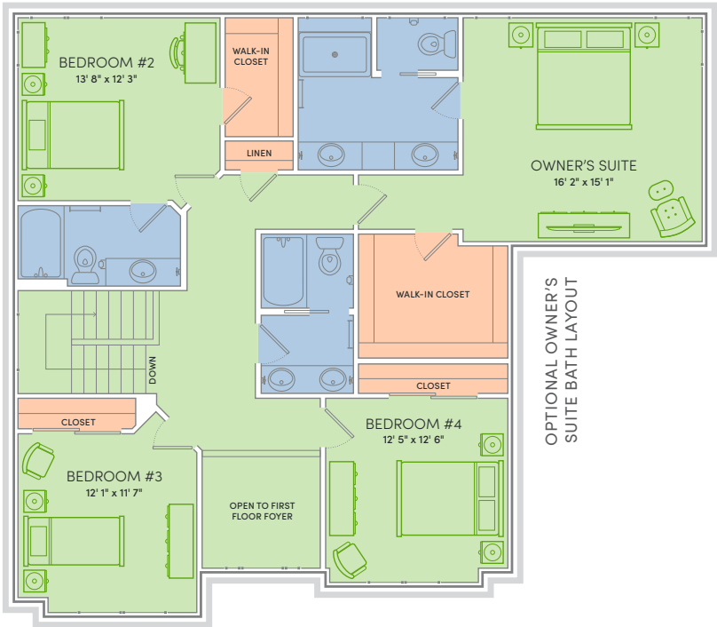
OPTIONAL OWNER'S SUITE BATH LAYOUT