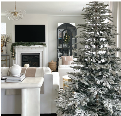
1 | Submitted by Suphansa Phetvisay