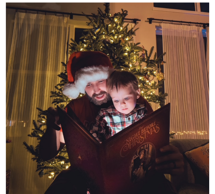
3 | Submitted by Heather Teske