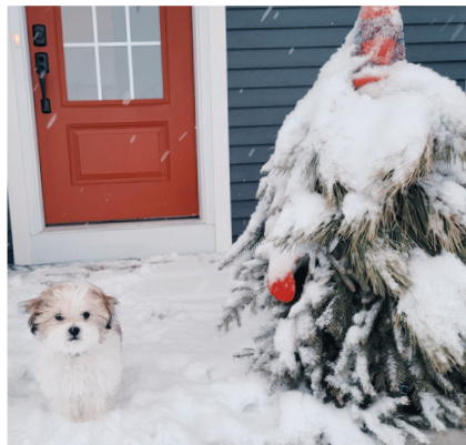
2 | Submitted by Tara Forsman