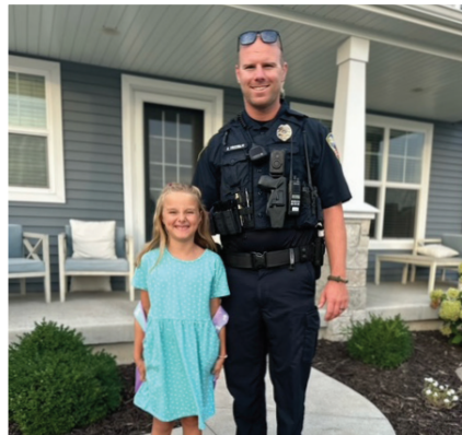
2 Submitted by Ashley Freeman