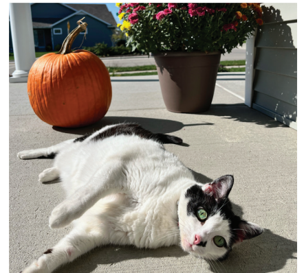
3 Submitted by Katy Ballard