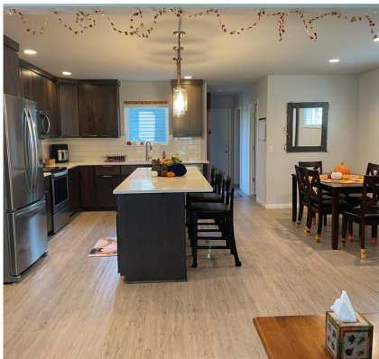
1 Submitted by ECylie Colbeth