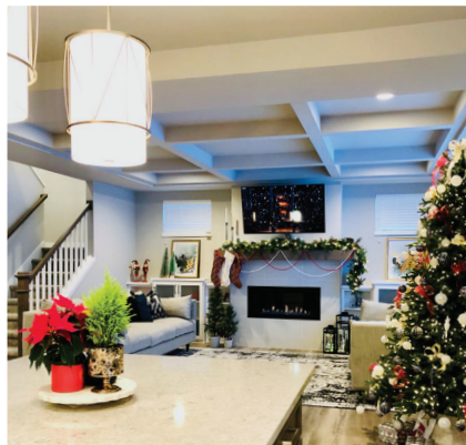
2 | Submitted by Trinh Pham