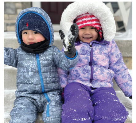
3 | Submitted by Phu Lai