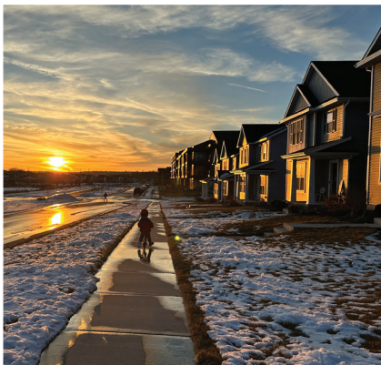
1 | Submitted by Lauren Van Beckum