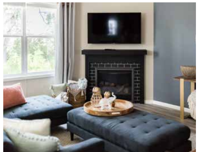
*Features from a similar model