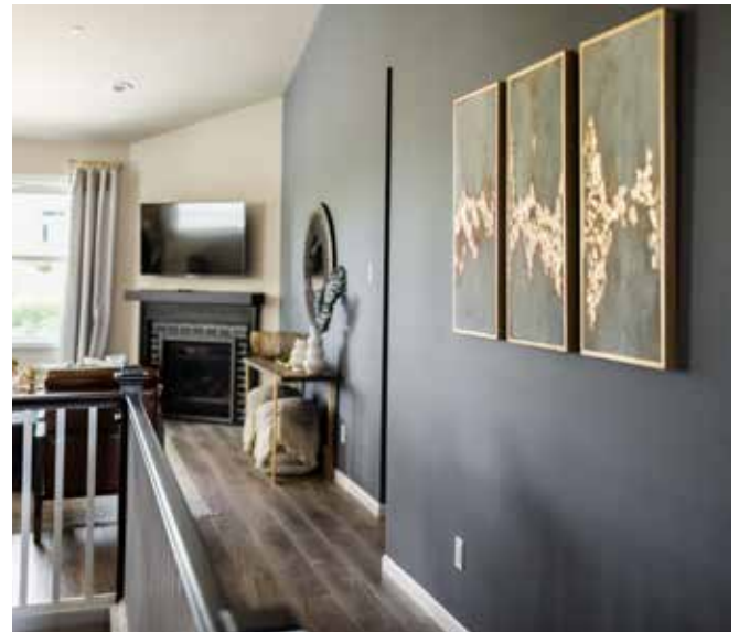
*Features from a similar model