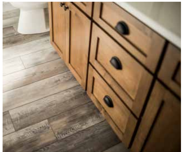
*Features from a similar model