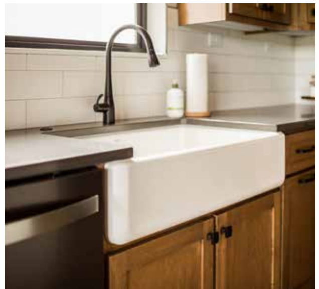
*Features from a similar model

For Signature Series home plans, please talk with your New Home Specialist to learn more about plan-specific details.