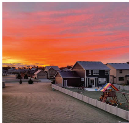
2