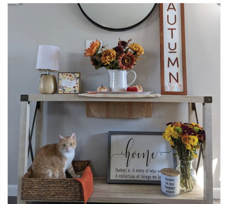
3 Submitted by Megan Straub