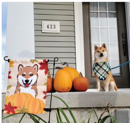
1 Submitted by Alyssa Johnson