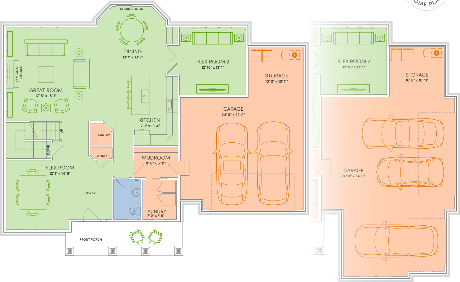
OPTIONAL 3-CAR SIDE ENTRY GARAGE