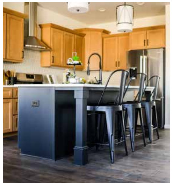
*Features from a similar model