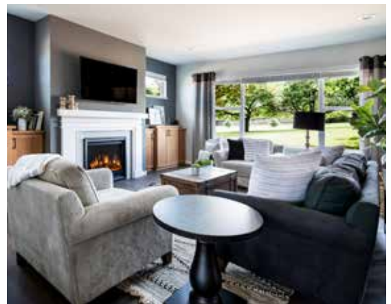
*Features from a similar model

For Signature Series home plans, please talk with your New Home Specialist to learn more about plan-specific details.