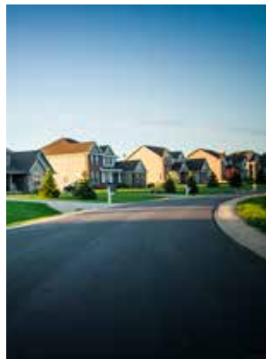
Photos are representative, not actual photos at Village at Autumn Lake.